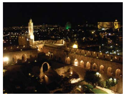
Highlights... Jerusalem • Masada • Dead Sea • Mount of Olives • Garden Tomb • Bethlehem • Yad Vashem • Tel Aviv • Sea of Galilee • Tiberias • Nazareth • Haifa • Caesarea